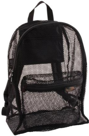
Mesh backpack not permitted.

No. Mesh backpacks are not allowed. Students are permitted to only use clear backpacks (see example).