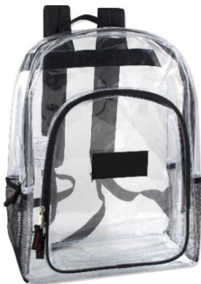
Example of clear backpack with mesh side pockets.

Yes. Mesh side pockets are allowed on the backpack (see example).