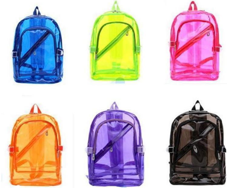
Example of colored transparent backpacks that ARE NOT allowed.

No. Colored, transparent backpacks are not allowed (see example). Only fully clear backpacks.