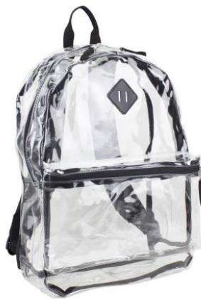
Example of permitted clear backpack.