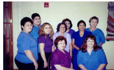
2004-2005 NEESPA Officers