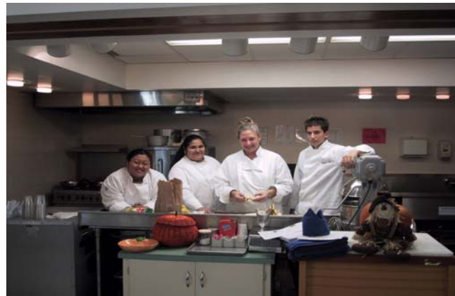
MacArthur Culinary Students