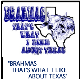
Item # 3 WHITE LONG-SLEEVE $20.00