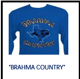
Item # 8 BLUE LONG-SLEEVE $20.00