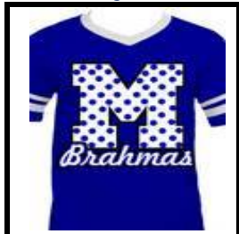
Item # 7 V-NECK TEE $15.00