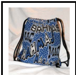
Item # 14 BRAHMA DRAWSTRING $20.00