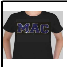
Item # 5 WOMEN'S BLING TEE $30.00

Adult Sizes - Small, Med, Large, XL, 2X, 3X, 4X - Child Sizes (Item #1 only) - Small, Med, Large, XL, Adult Small