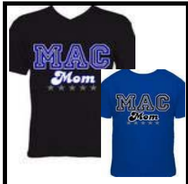
Item # 6 MAC MOM (BLK OR BLUE) $25.00

Adult Sizes - Small, Med, Large, XL, 2X, 3X, 4X - Child Sizes (Item #1 only) - Small, Med, Large, XL, Adult Small