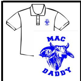
Item # 4 /BLUE OR WHITE SHORT-SLEEVE POLO $25.00