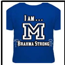
Item # 1 CHILD'S TEE $10.00