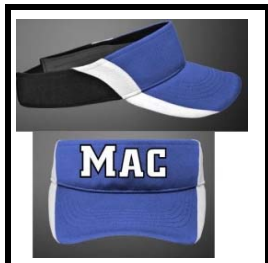
Item # 12 VISOR $18.00