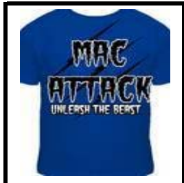
Item # 2 SHORT-SLEEVE TEE $15.00