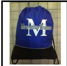
Item # 10 NYLON DRAWSTRING $10.00