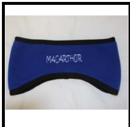
Item # 11 EAR MUFFS $10.00