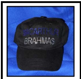
Item # 13 BLING CAP $15.00