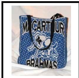
Item # 15 BRAHMA TOTE $25.00

Make Checks Payable to : MACARTHUR SPIRIT CLUB PO Box 171334 San Antonio TX 78217-1334