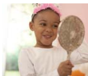
Oral Motor Awareness

L.E.A.P. is a preschool speech therapy service for children displaying a deficit in the areas of articulation, phonology and / or expressive language. Instruction occurs in the naturalistic setting of a preschool classroom with developmentally appropriate play centers.