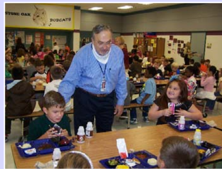
Stone Oak celebrated and promoted nutritional eating habits with National School Lunch Week.