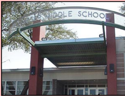
Four Krueger students were honored for their photography at the San Antonio Founder's Day celebration.