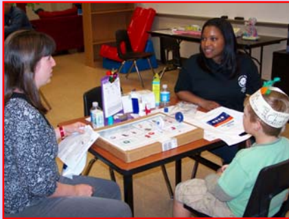
Churchill hosted the Asthma Blow Out! Education Health Fair to teach the community about asthma control.