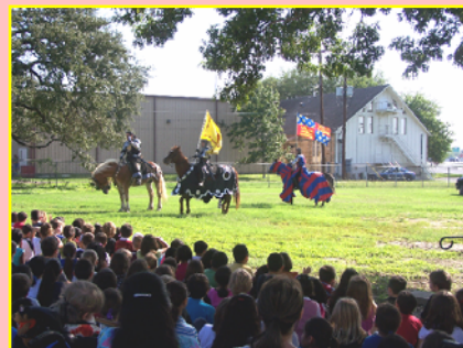
Castle Hills hosted the Knights of the Guild for an educational jousting tournament.