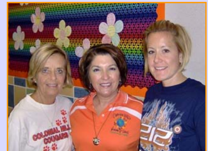
Two Zeta Tau Alpha members and Colonial Hills teachers gave a school supply donation to the school's family specialist as a yearly contribution.