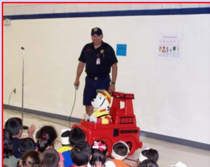
Olmos celebrated Fire Prevention Week and welcomed Sparky the fire dog to teach students about fire safety.