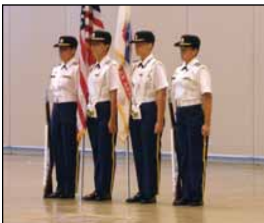
MacArthur JROTC teams beat out dozens of teams to win their national titles.

The competition drew teams from Louisiana, Oklahoma and throughout Texas to include the outstanding teams from Flour Bluff in Corpus Christi, John Jay, Brandeis, Clark and Marshall high schools in the San Antonio area.