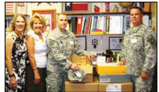
Fort Sam Houston representatives drop off a special delivery of school supplies.